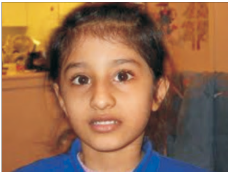
TARA Tara, my love, my deity, my soul's song.